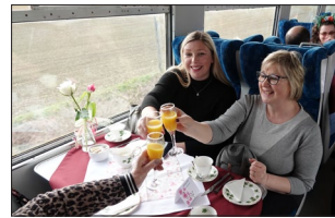
Enjoying an afternoon tea