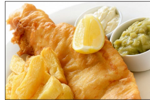
The Wensleydale Fryer